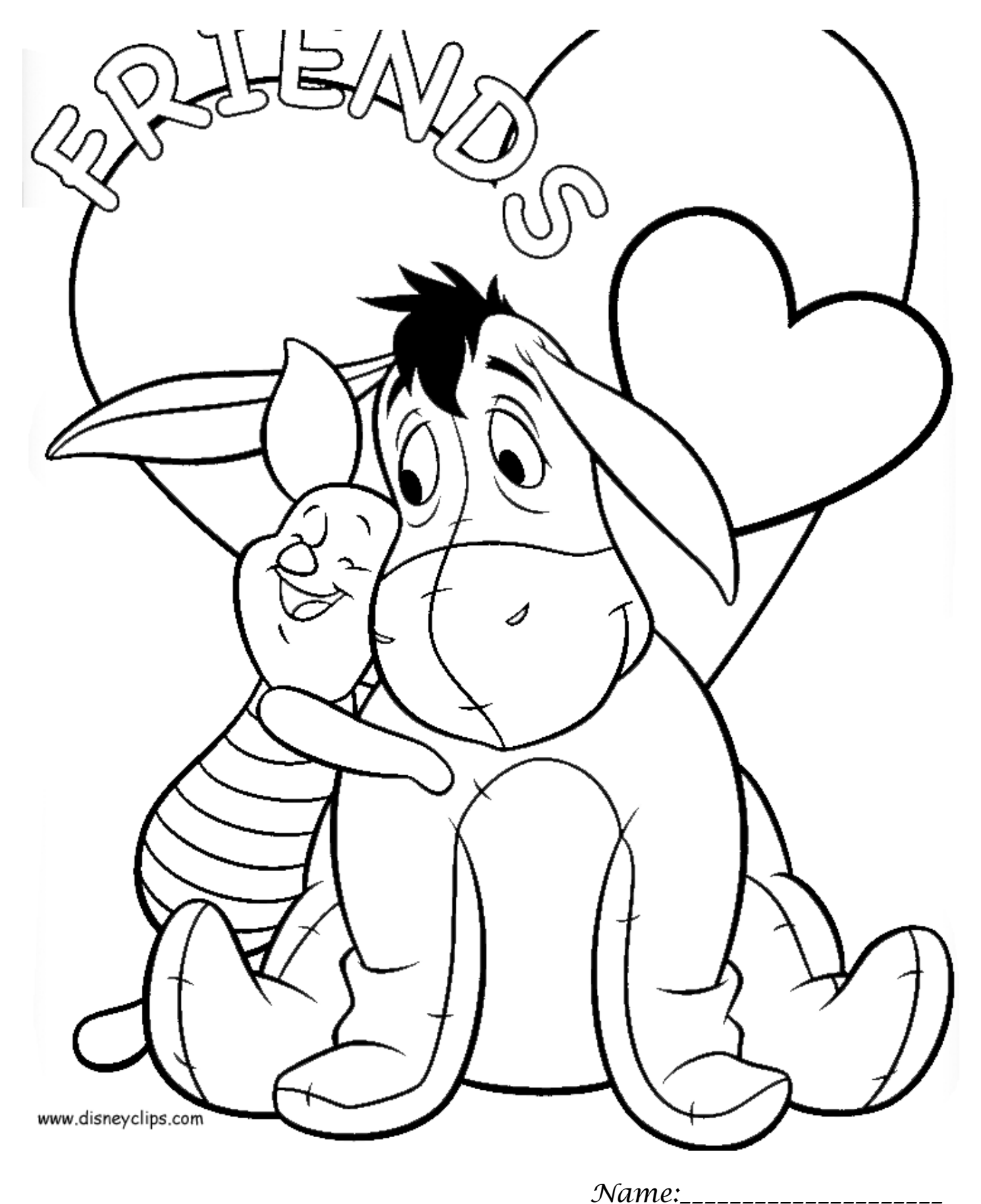
Happy Valentines Day! Have fun coloring and bring your completed picture back to church and we will hang it up!